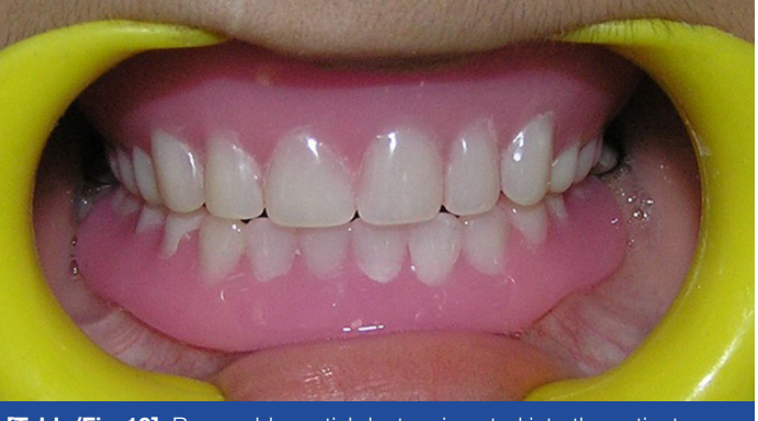
[Table/Fig-10]: Removable partial denture inserted into the patient

Ehlers Danlos syndrome is a rare connective tissue syndrome that mainly affects the skin and the joints. EDS is a rare type of disorder of the connective tissue that affects the collagen metabolism in which deficiency and /or disordered deposition of collagen takes place